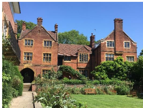
Westcott House, North Range, south face, red brick, Ham Hill dressings, 1899