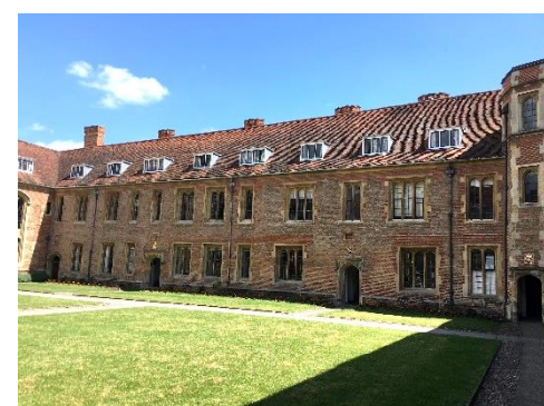
Magdalene First Court, South Range, red brick, Weldon dressings, late C15