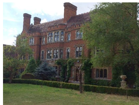
Ridley Hall, College Lawn, West Range, red brick, Weldon dressings, 1891-92