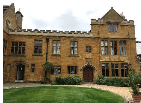
Trinity Hall Library Court, Master's Lodge, Ham Hill ashlar and dressings, 1852, 1890-2