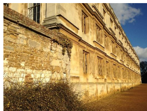
Clare Old Court, South Range, south face, Ketton, 1640- 42