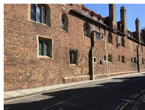
Queens' Front Court, South Range, south face, red brick, Barnack and Clunch dressings, 1448-9