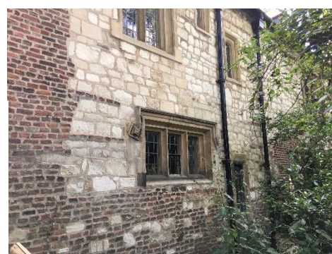
Peterhouse Old Court, North Range, north face, Clunch and red brick, 1424-5