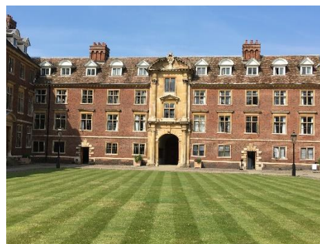
St Catharine's Main Court, West Range, east face, red brick, Ketton dressings, 1674-75