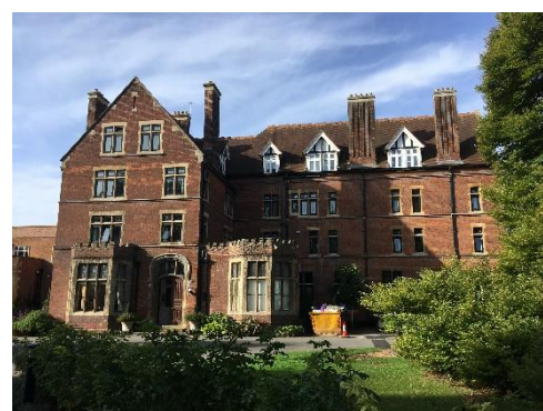
Homerton, Cavendish Building, red brick, Bath dressings, 1876- 1903