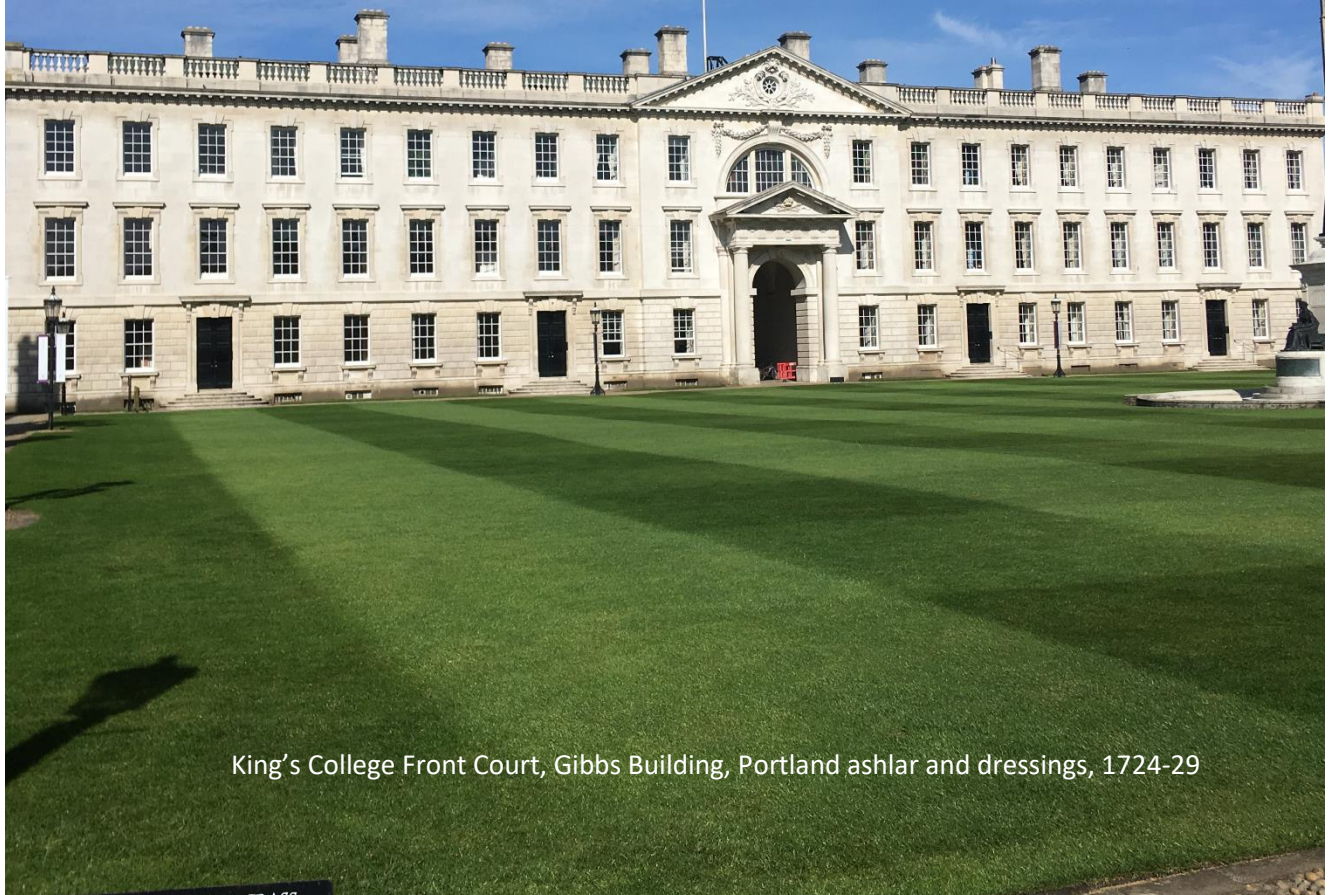
King's College Front Court, Gibbs Building, Portland ashlar and dressings, 1724-29