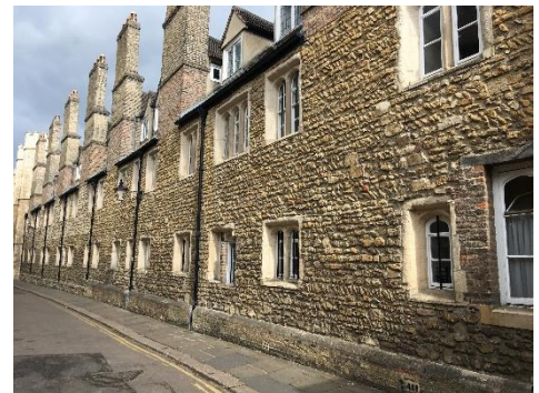
Trinity Great Court, South Range, south face, ragstone and blockstone rubble walls, Barnack and Clunch dressings, c1481