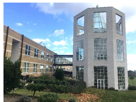
Churchill Møller Centre, Portland Whitbed ashlar and plat bands, 1989- 92