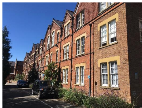
St Edmund's Norfolk Building south, brown brick, Bath dressings, 1896