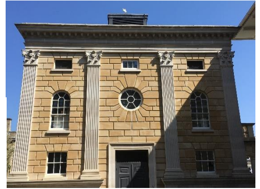
Downing Howard Building, Ketton and Portland Whitbed, 1986