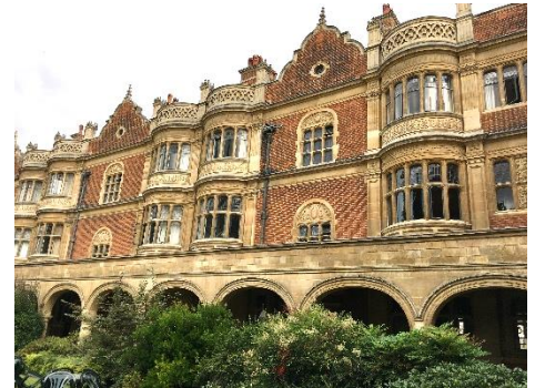
Sidney Cloister Court, East Range, red brick, Weldon dressings, 1890-1