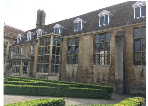
Emmanuel Hall Range, north face, Barnack (1584-7), Ketton (1760-4), Ancaster (1876)