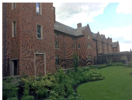
Wesley House, North Range (and Jesus West Court), red brick, Ancaster Striped Freestone dressings 1925-30