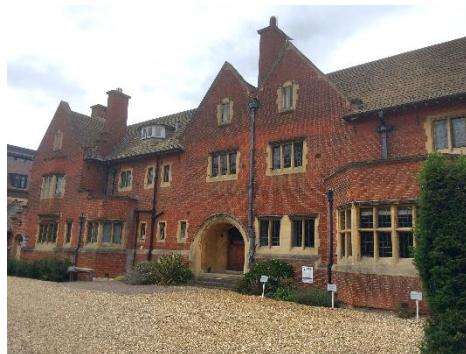
Westminster College Main Building, red brick, Clipsham dressings, ?Stonesfield stone slates