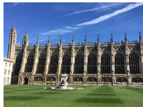
King's College Chapel, Weldon over Magnesian Limestone, 1446-85