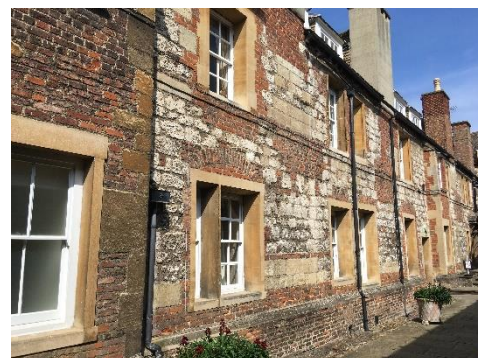
Christ's First Court, south range, south face, Clunch, 1505- 11