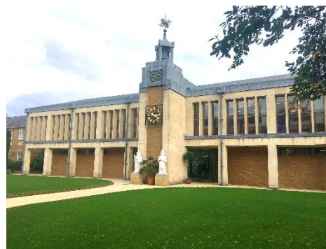
Wolfson Lee Court, Lee Seng Ten Library, Ancaster Hard White ashlar, 1992-94