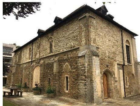
St John's, School of Pythagoras, Clunch and ragston rubble, Barnack and Clunch dressings, c1200