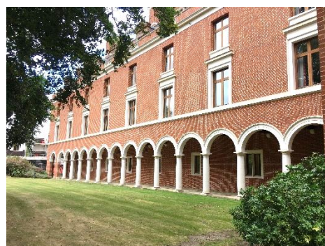
Selwyn Ann's Court, South Range south face, red brick, Ancaster Hard White dressings, 2003-09