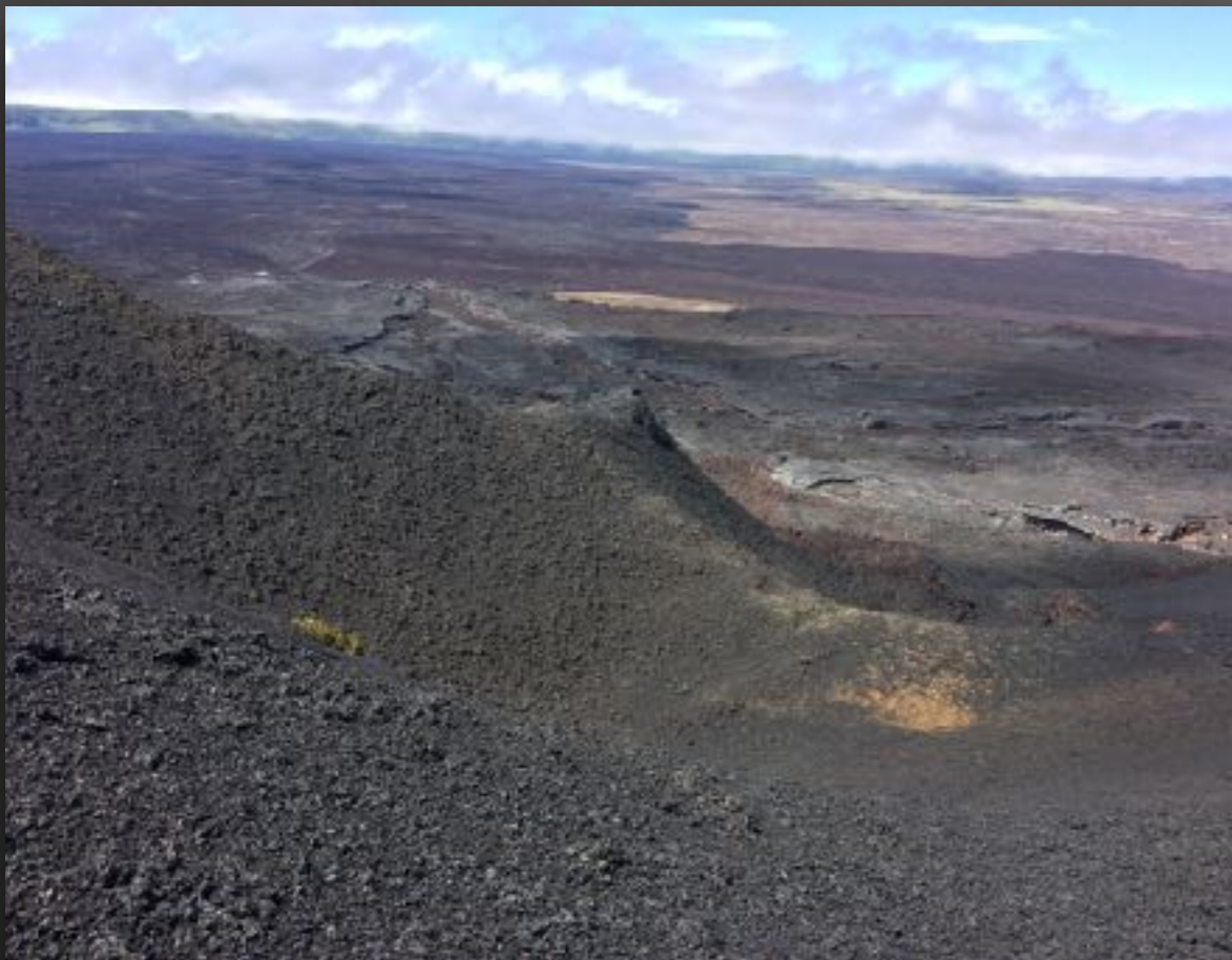
V. Sierra Negra 2005 fissure eruption