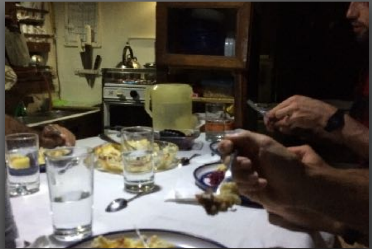
On board Pirata