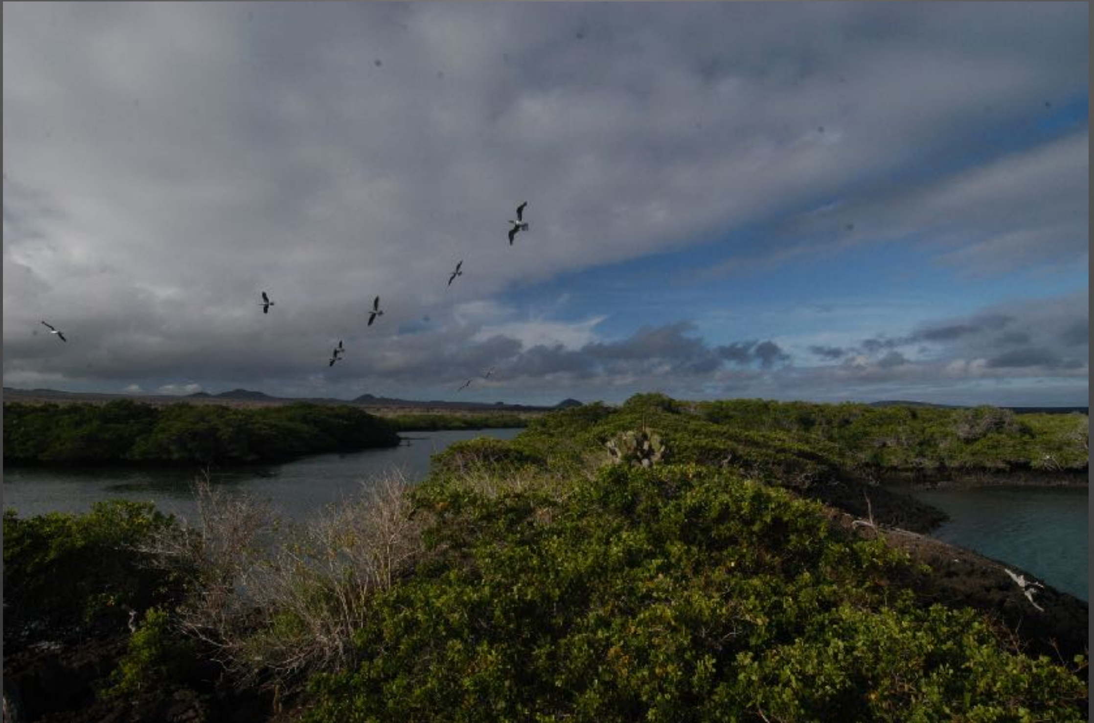
Southern Santiago, Bahia de Tiburon