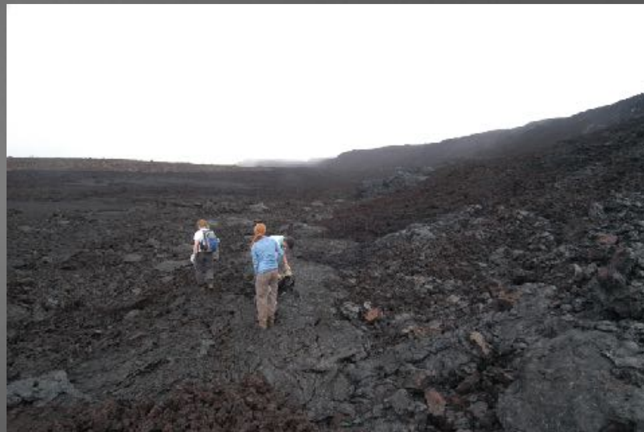
Volcan Sierra Negra, Isabela