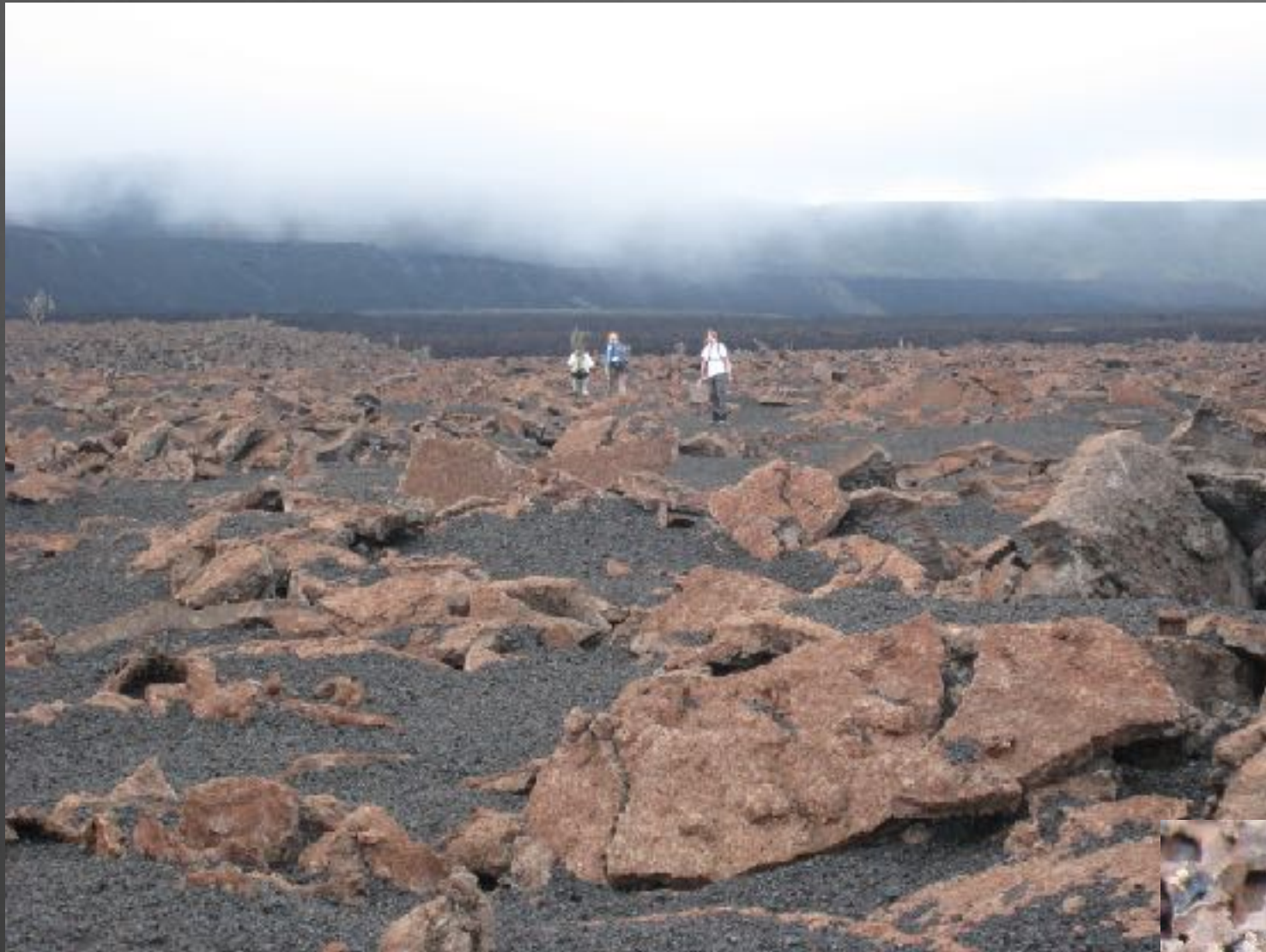
Volcan Sierra Negra, Isabela