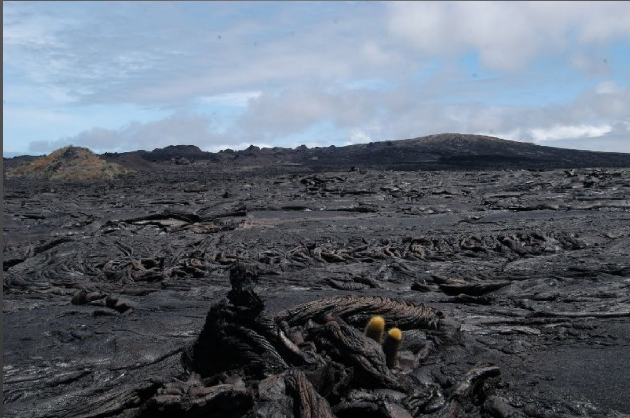
Young pahoehoe flows, Eastern Santiago