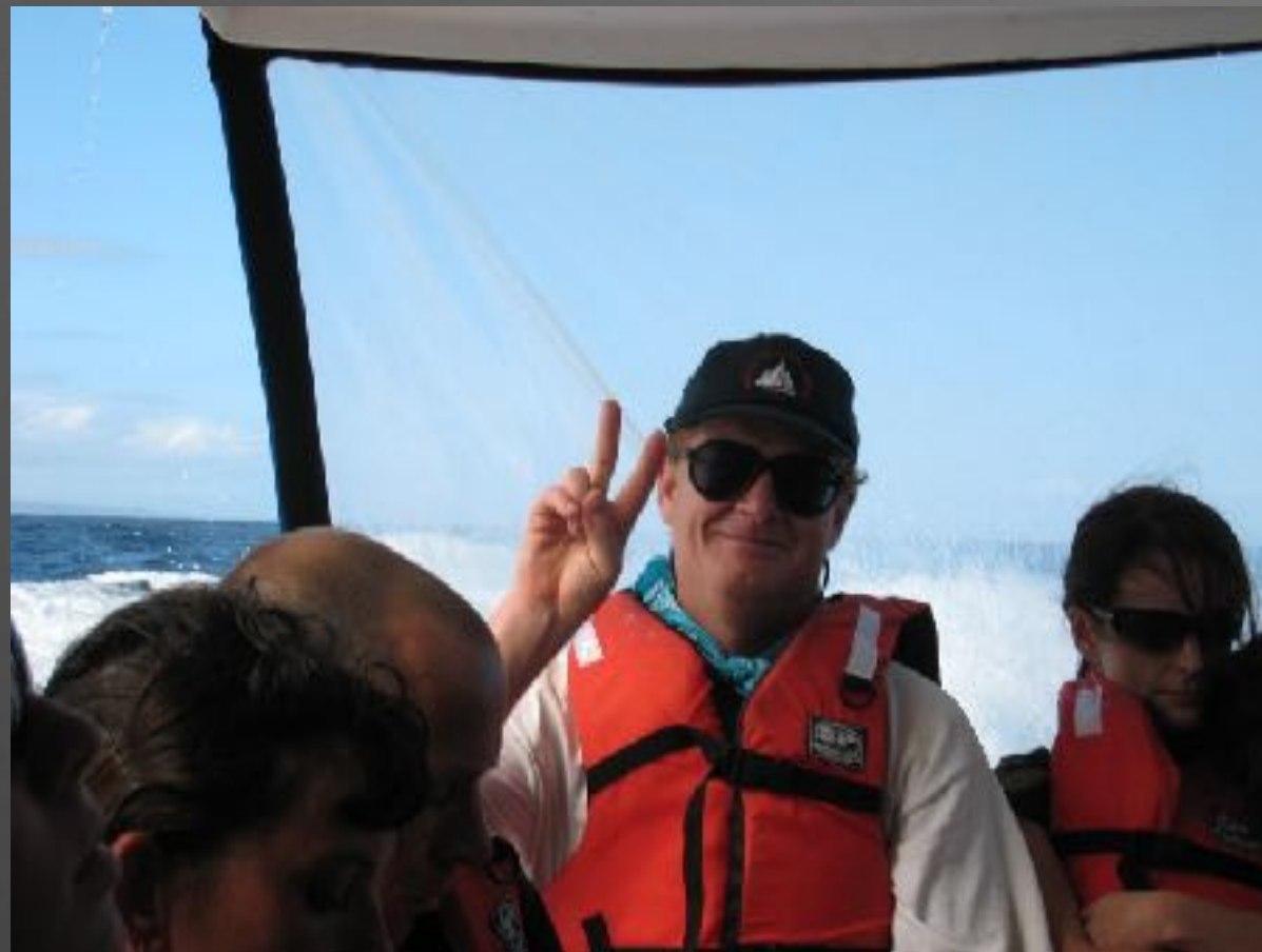
Speed boat to Isabela