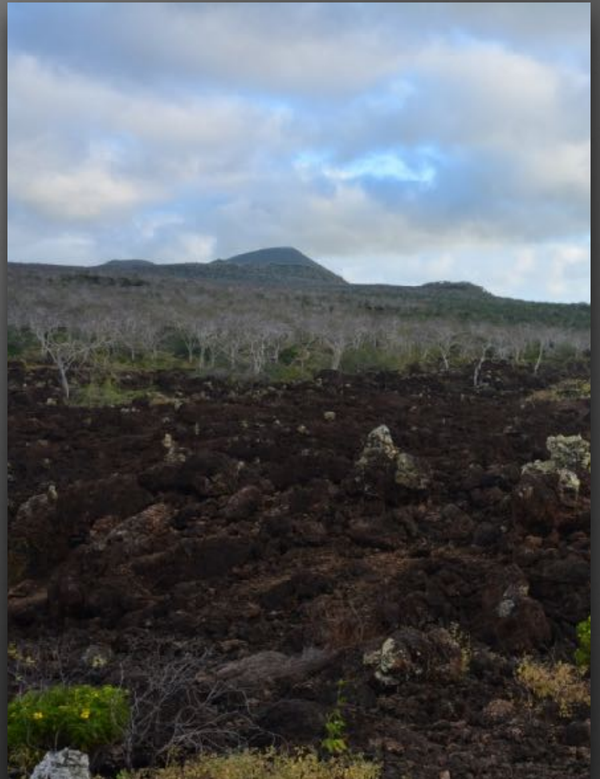
Post Office Bay