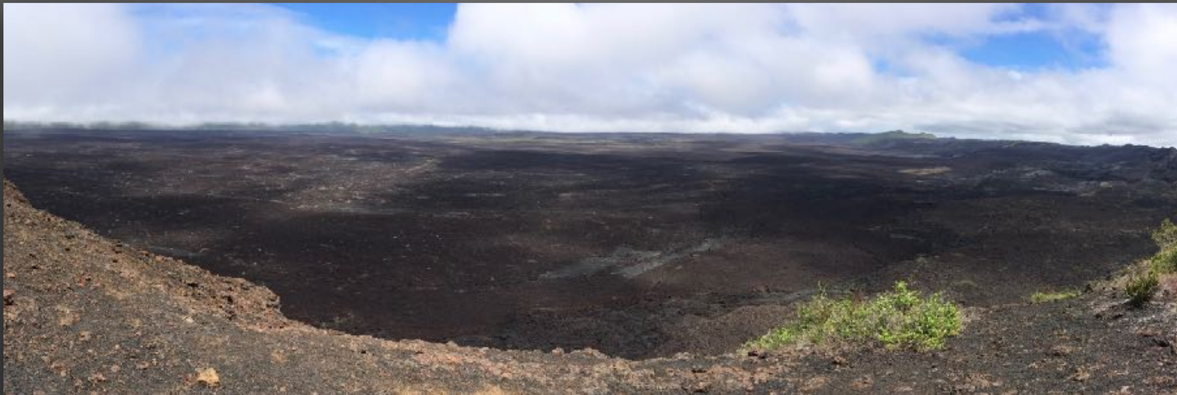
V. Sierra Negra 2005 fissure eruption