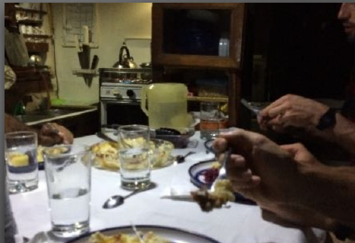
On board Pirata