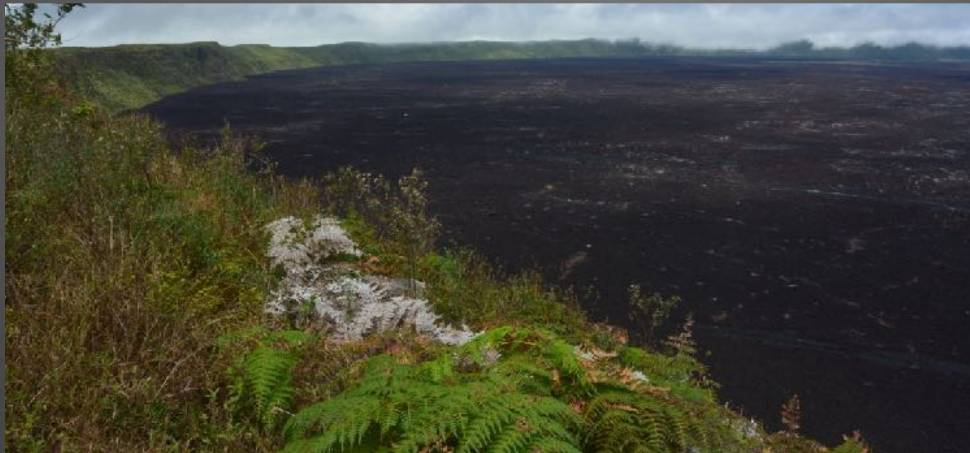
Volcan Sierra Negra