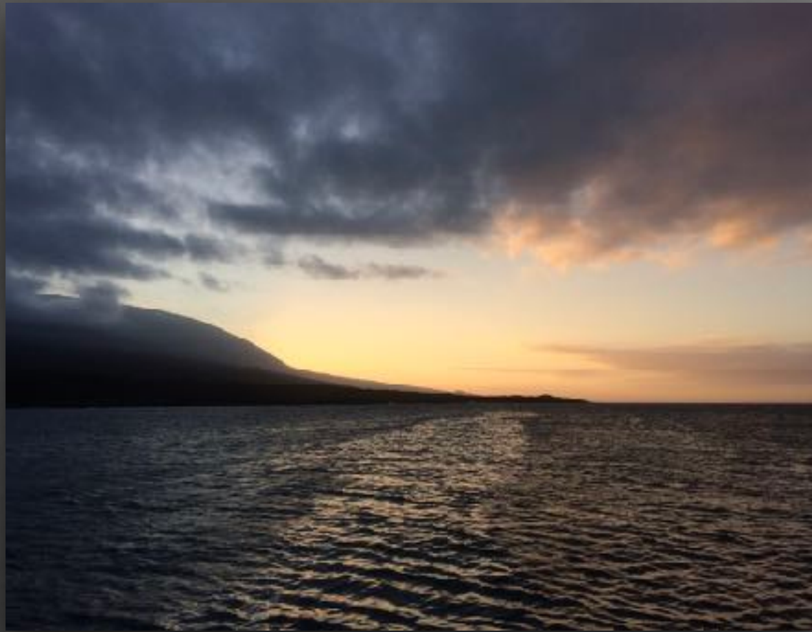
Volcan Wolf, Isabela