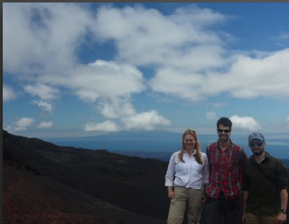
V. Sierra Negra