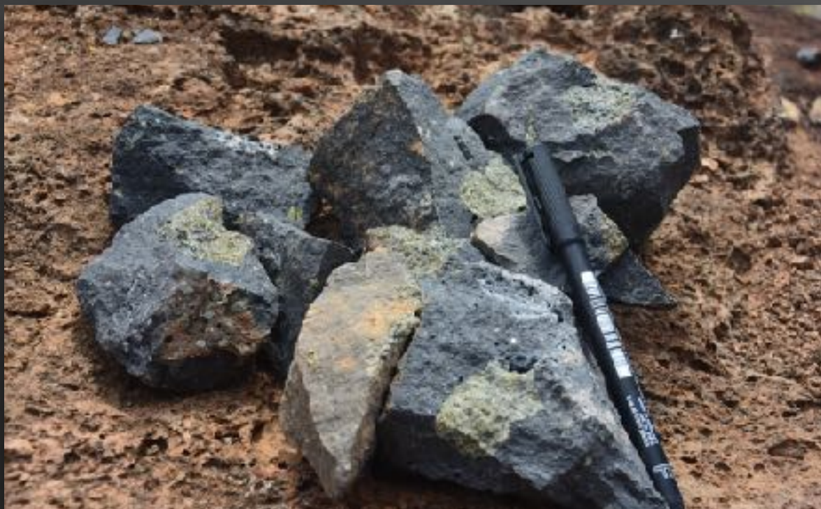
Basalt hosted xenoliths