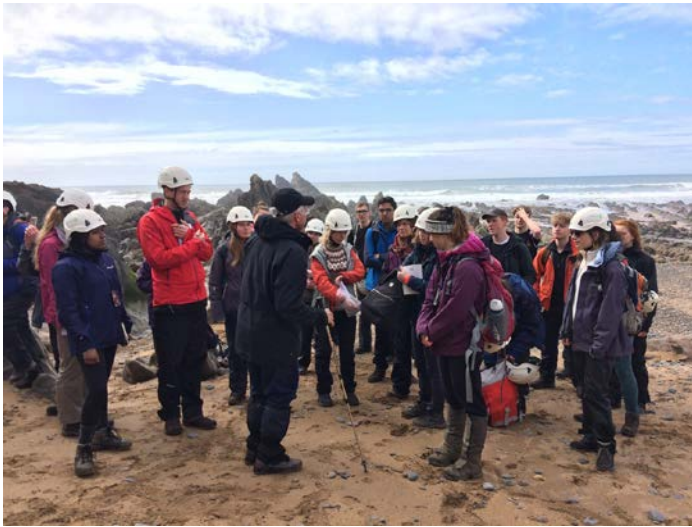
Students enjoying a day on the beach in Cornwall.

The Cornwall field trip offers a superb opportunity to visit a beautiful part of the country and to see a variety of world-famous rocks. During the trip you will observe and interpret igneous and metamorphic rocks in the field, in order to understand petrogenetic processes and their close interplay with regional tectonics. The trip will provide a stimulating revision and application of key concepts that you have been taught during the ESB course, and provide you with excellent field examples for exam essay questions.